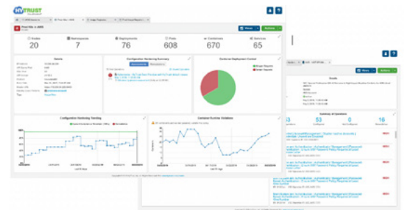
Comprehensive dashboards and reporting for efficient operations

Entrust pioneered advanced security for managing virtualized data centers and has scaled to meet the needs of mid-sized and large enterprises and public sector organizations. As architectures have evolved from virtual to software defined, private cloud – and now hybrid multi-cloud – CloudControl continues to be the leading option for lowering risk of data loss or downtime due to compromise or abuse of the administration interface. Entrust also continuously innovated broader capabilities across multiple dimensions, while maintaining unified policy and visibility. As a result, organizations can be assured that CloudControl is a superior strategic choice for risk management and avoiding an endless parade of point solutions with limited lifespan.